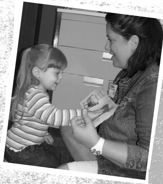
An ACC speech-language pathologist works with a young speech therapy client.

American Speech-Language-Hearing Association