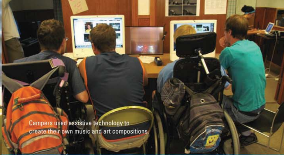
Campers used assistive technology to create their own music and art compositions.

Swimming and splashing in the cool, refreshing water of Lake Isabel was one of the many highlights of this summer's Techno-Camp (June 28 – July 3). For many of these campers, it was their first-ever swim in a lake. Some even climbed aboard a Jet Ski!