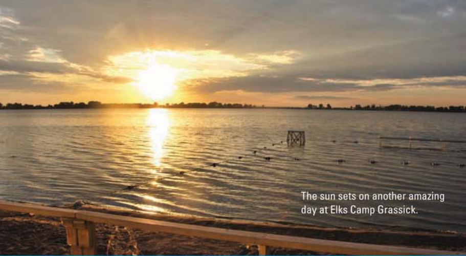
The sun sets on another amazing day at Elks Camp Grassick.