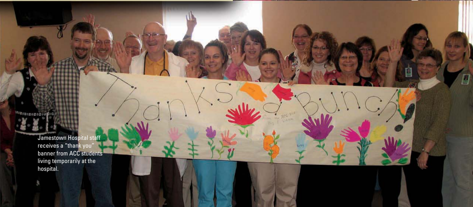
Jamestown Hospital staff receives a "thank you" banner from ACC students living temporarily at the hospital.