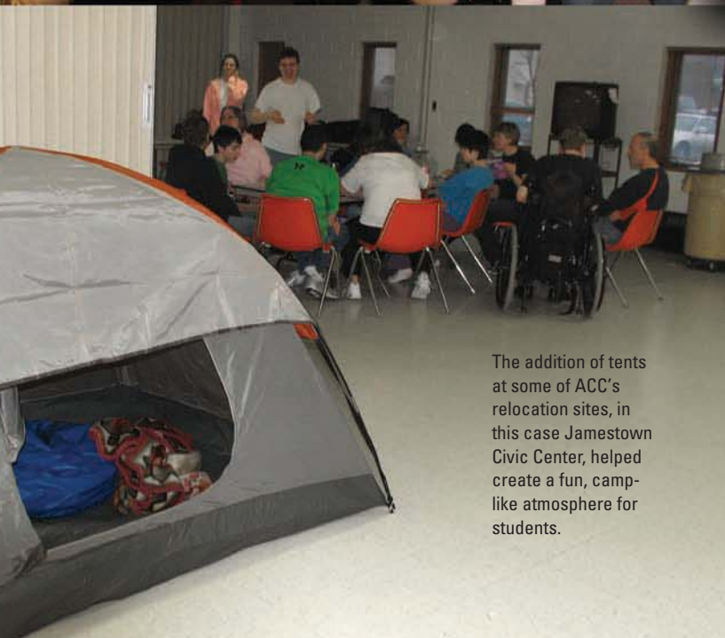
The addition of tents at some of ACC's relocation sites, in this case Jamestown Civic Center, helped create a fun, camp-like atmosphere for students.